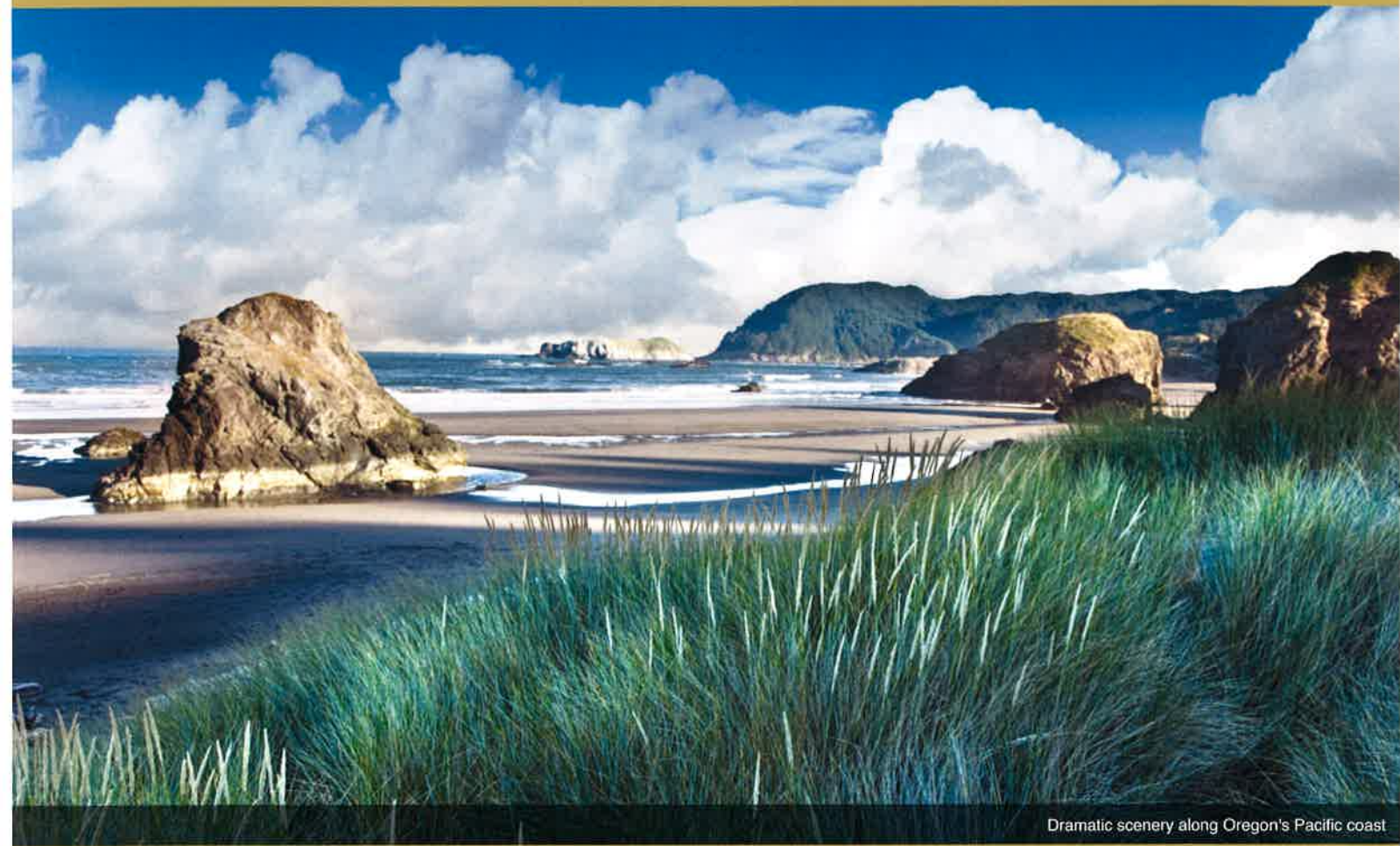
Dramatic scenery along Oregon's Pacific coast