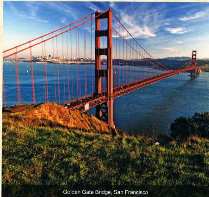
Golden Gate Bridge, San Francisco

Depart for home from this memorable vacation with a group transfer to San Francisco International Airport for flights out after 12:00 p.m. Meal: B