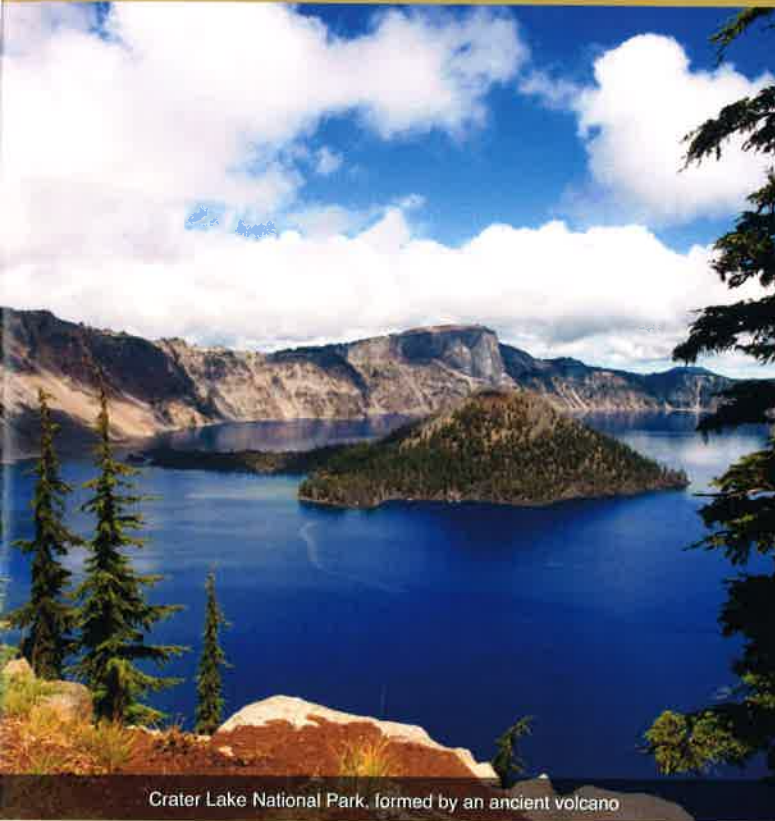
Crater Lake National Park, formed by an ancient volcano